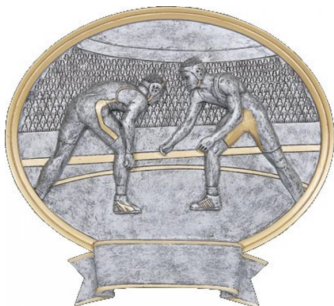
1st Place Award